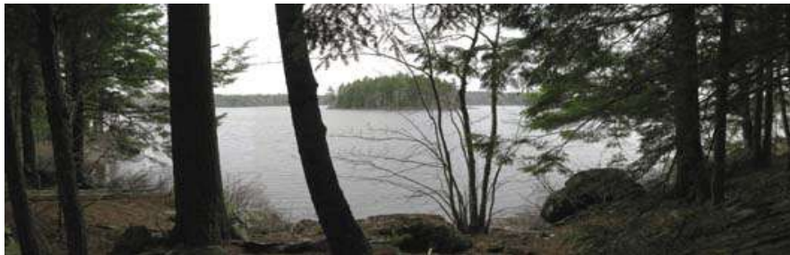
Lake view ... I guess adding a canoe to the list of purchases is a good idea!