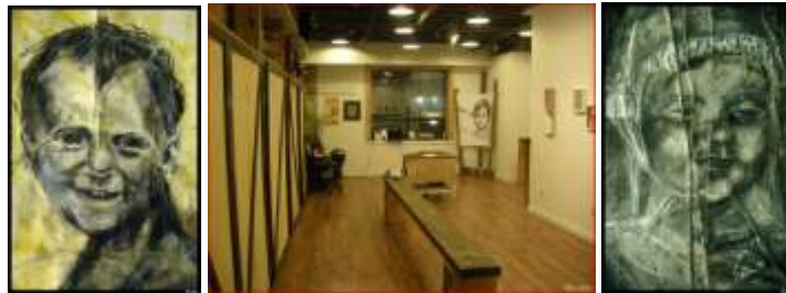
Two Paintings by Sio, (of Influx Studio) from his Grown Up Child series and a picture of Influx Studio

June -> Adult Drawing Workshops at Influx Studio – This series of workshops led by Deb are for those adults: whose inner child wants to play, who want to improve their sketching ability, and for public school teachers who want to pick up technical pointers to pass onto their students. These four workshops are an introduction to: contour, gesture, life drawing and art appreciation. The first three classes will take place in studio then for the final class we will venture out to the galleries for an art appreciation tour. Scheduled to take place every Saturday afternoon in June from 3-5PM these workshops will happen at Influx Studio which is located at 141 Spadina & Richmond. The cost is 200.+materials (25. max). To register for this workshop series call 416 537 9483.